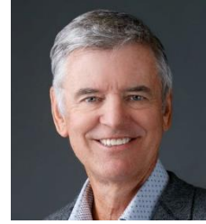
Professor John Hattie Melbourne University